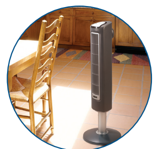
3 Quiet Speeds