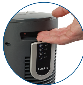
Easy-Carry Handle and On-Board Remote Storage