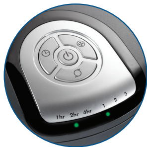
Electronic Timer (up to 7 hours)