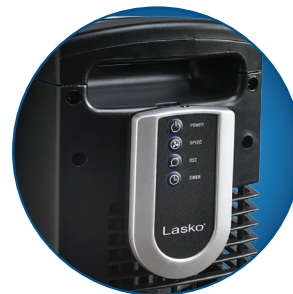
Easy-Carry Handle and On-Board Remote Storage