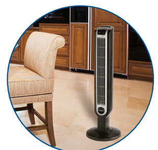
3 Quiet Speeds