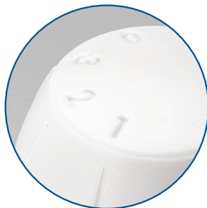
3 Quiet Speeds